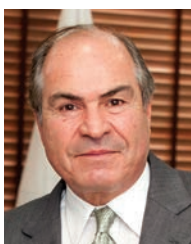
H.E. Dr. Hani Mulki Prime Minister of the Hashemite Kingdom of Jordan

The appointment of H.E. Dr. Hani Mulki as Prime Minister in May 2016 has led to renewed optimism for people