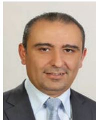
H.E. Nasser Shraideh Chief Commissioner

A pivotal export center that links Asia with North Africa, ASEZ (Aqaba Special Economic Zone), is Jordan's gateway to global commerce and a premier tourist destination, and is strategically located at the crossroads of four countries and three continents. Aqaba spans approximately 375 square kilometers and is making exciting headlines around the world. The area's growth in terms of people and economic worth is nothing short of mind-blowing, and it is shown in the improvement of the citizens' quality of life. The master plan that was established in 2001 from the vision of His Majesty King Abdullah II and ASEZ encompasses real estate, tourism, logistics, industrial parks, education, health and other investment sectors to create more sustainable growth. Specialized areas have already been established, including Aqaba Town (fast becoming Jordan's second city), the