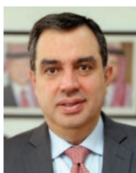
H.E. Eng. Imad Fakhoury Minister of Planning and International Cooperation

throughout the country, as the Syrian refugee crisis puts pressure on local housing and services. By appointing a thoughtful diplomat and economist, His Majesty King Abdullah II has endorsed a credible public figure of whom great things are expected.