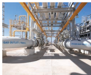
Jordanian Egyptian FAJR for Natural Gas Transmission & Supply - Aqaba