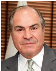
H.E. Dr. Hani Mulki Prime Minister of the Hashemite Kingdom of Jordan

The appointment of H.E. Dr. Hani Mulki as Prime Minister in May 2016 has led to renewed optimism for people