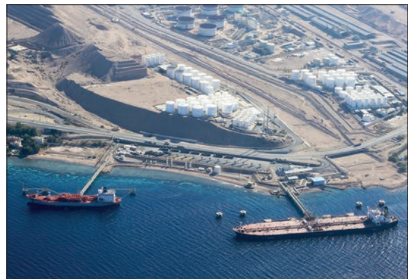
At the crossroads of four countries and three continents.

Plans are afoot for a new group of terminals to be either expanded or constructed, including terminals for liquefied natural gas (LNG) at a cost of $140 million and another for liquefied petroleum gas (LPG) at a cost of $25 million. From one port in 2000, to 10 specialized ports in 2016, and 12 by 2018, the industrial possibilities are massive, as are the incentives for SMEs to establish themselves. The King Hussein International Airport has been developed in line with international standards and has a capacity of two million passengers per year. The industries in