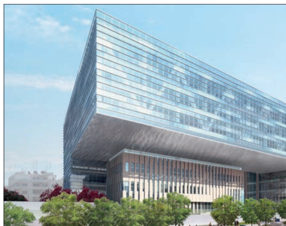
The New Headquarters for Housing Bank.

Meanwhile, as the largest retail bank in the country with an overall market share of 15%, and a 38% market share of saving deposit accounts, matched by an extensive network of 129 branches and 215 ATM's, HBTF enjoys the widest geographical reach and the largest customer base in Jordan and is thus able to provide the highest levels of services to retail clients, in addition to commercial clients wherever they are located in Jordan. On an international level, HBTF is present through branches and subsidiaries in the United Kingdom, Algeria,