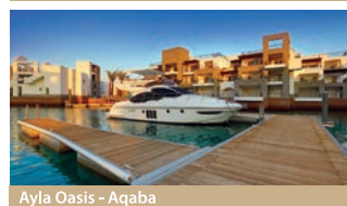
Ayla Oasis - Aqaba